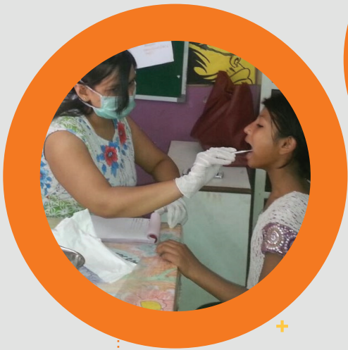
Dental check up camp at Kilkari Home, New Delhi

A total of 67 Health camps were conducted in April benefitting 14,695 people across locations. Awareness camps on various health issues including oral, menstrual and general hygiene were also conducted during the month to reach out 1,508 people.