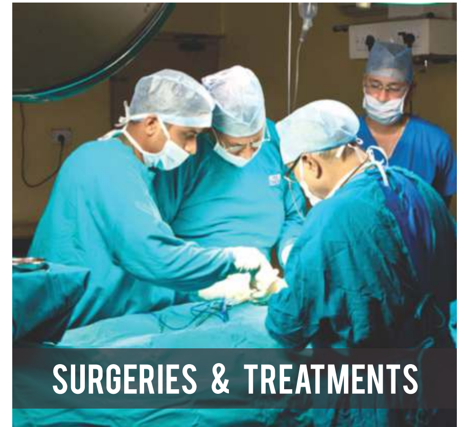
SURGERIES & TREATMENTS