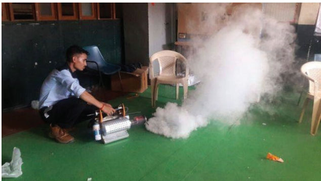
100 children from Rasta NGO were educated on Dengue & Malaria and also immunized for Td. Fumigation was organised with the help of Max Super Speciality Hospital, Patparganj