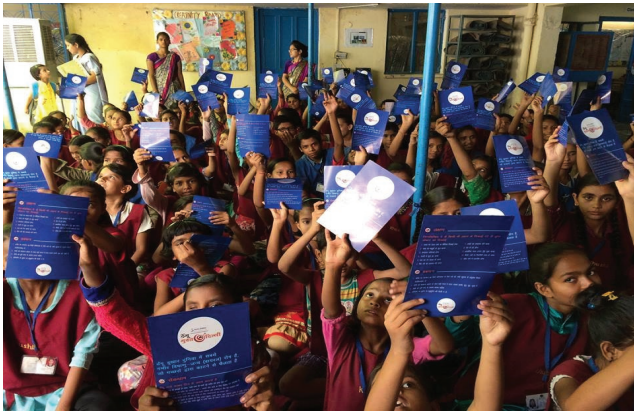
300 children educated about Dengue and other mosquito borne diseases in Deoli Gaon with Khushi NGO