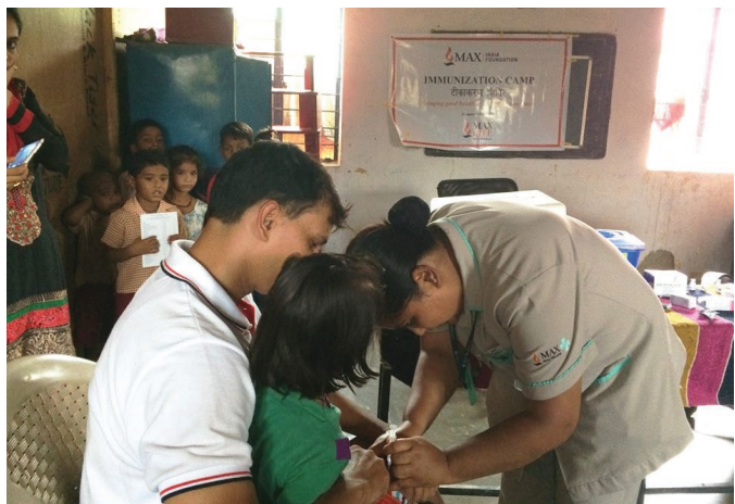
80 children immunized for Hepatitis B at Nala Colony, Delhi with support of Feedback Foundation.