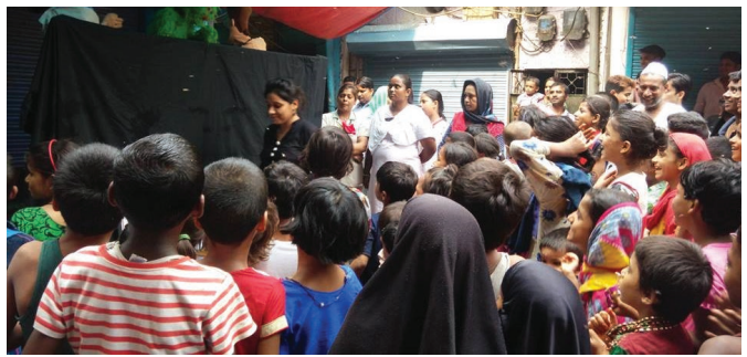
200 people sensitized on mosquito borne diseases at Shastrri Park, Delhi with NGO Chetanalaya