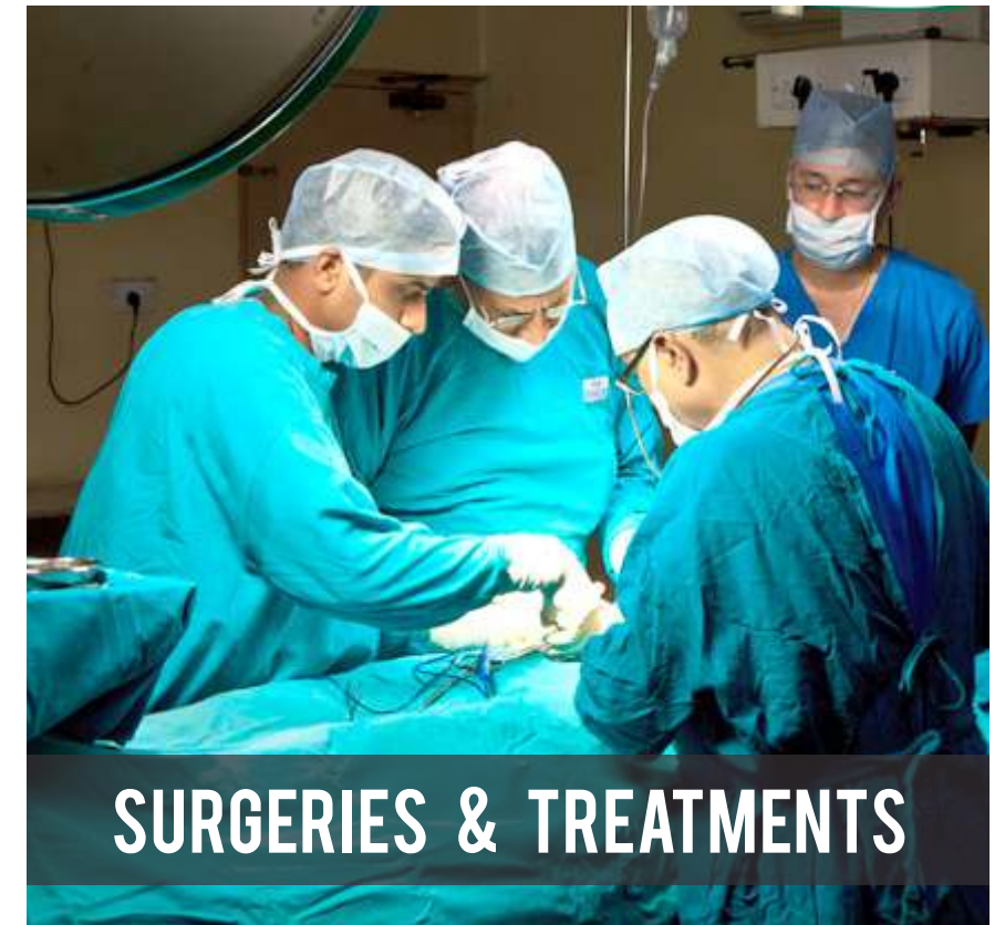
SURGERIES & TREATMENTS