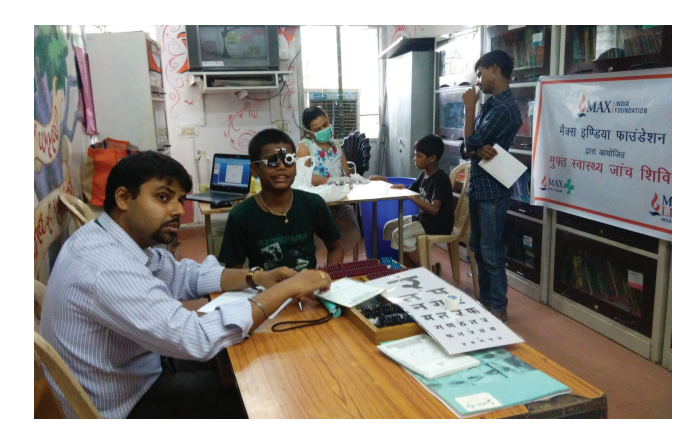
Eye and Dental check up camp, Ummeed Home for Boys, New Delhi