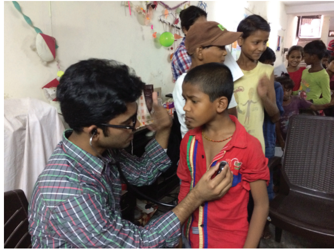
Typhoid immunization and Oral Hygiene awareness camp at