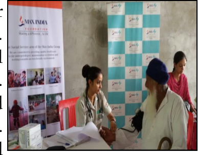
Multi Specialty Health camp at Behrampur Bet (Punjab)