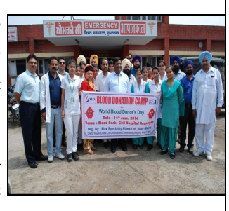
Blood Donation camp by MSF.