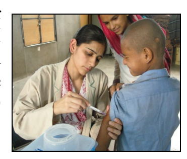
Immunization camp with NGO SPYM Nizammudin

Children immunized to date: 35913, many of whom have got three or more shots each.